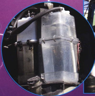
Hydrogen Generator Installed In a Dump Truck

The key to the success of our generators is our proprietary patent-pending nano-coated stainless steel plates. When the generator is paired with a bubbler reservoir with the addition of potassium hydroxide, it creates a combination of hydrogen and oxygen known as HHO gas. The HHO is pulled into your engine air intake through a fuel line, or clear plastic tubing, which runs from the output of the generator to the air filter case on your vehicle's engine. The use of a separate bubbler reservoir enables the generator to run 2,500 miles or more before water needs to be added, unlike other systems which need water every 200 miles. The HHO gas is mixed with equal proportions of water through a process called water electrolysis that takes place within the generator, once the water and potassium hydroxide react with the stainless steel plates and the engine is operating. The HHO meets air and fuel at the burn point, via the intake manifold, so the gas is burning in your vehicle's motor, instead of in the exhaust pipe, allowing the fuels to react completely. This greatly lowers harmful emissions- even burning the particulates, increases gas mileage and provides amplified horse-power and engine longevity.